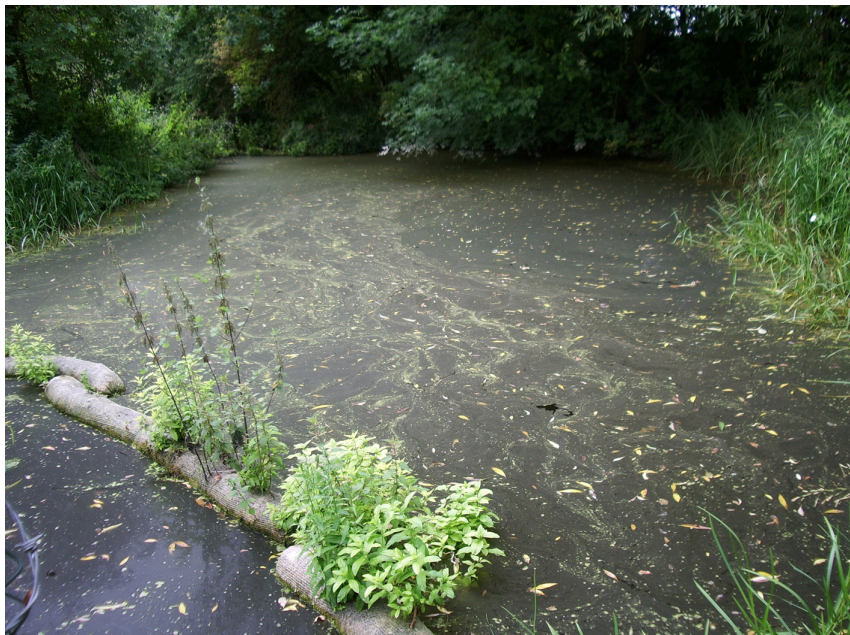
Figure 3: The Outfall Pool, Pumney Brook, 12 August 2005