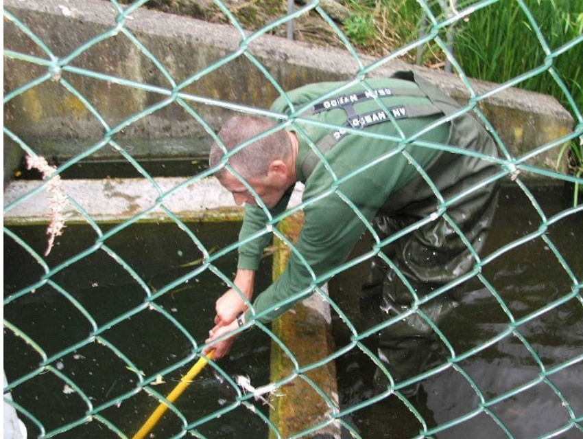
Figure 2: The author sampling the inner part of Pumney Brook PFA Effluent Outfall Pool, 25 August 2005.

No invertebrates were found in this location. The other samples were taken behind the author, to the left and right.